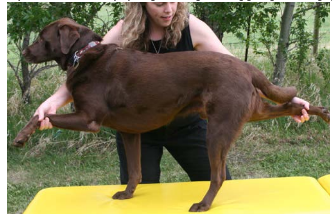
Stand and twist